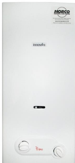
Primo 6 Litre (MP6) & Primo 11 Litre (MP11)