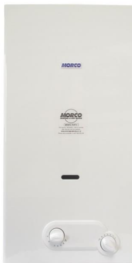
EUP 6 Litre & EUP 11 Litre