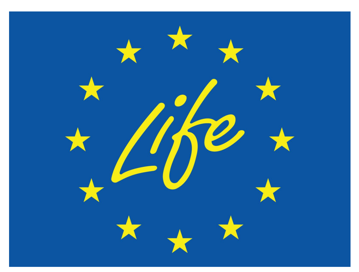
The 2023 LIFE Programme call for proposal is now open!

LIFE is the only EU Programme dedicated exclusively to the environment nature conservation and climate action. Under the "circular economy and quality of life" sub programme, LIFE has just opened a call for projects on the area of recovery of resources from waste, covering most of the streams (WEEE, batteries, ELV, construction waste, plastics, textiles, CRMs, packaging...).