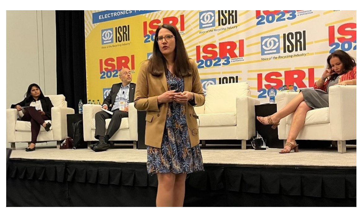
EuRIC participates at ISRI 2023 Convention

EuRIC participated at the <u>2023 ISRI Convention & Exhibition</u> in Nashville, Tennessee and presented the latest regulatory changes and proposals stemming from the EU Green Deal . The convention participants were particularly interested in the potential changes in trade of recycled materials stemming from the revision of the Waste Shipment Regulation.