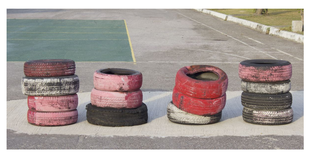
EU proposal to restrict microplastic use from tyre recycling

The European Commission has moved forward with its <u>proposal to restrict certain microplastics</u>. As it currently stands, the proposal would ban microplastics for use as granular infill from tyre recycling. EuRIC reacted strongly in condemning the proposal in a press release (see below) and is actively advocating our sector's position in cooperation with the <u>Mechanical Tyre Recycling (MTR)</u> branch. The proposal will now be scrutinised by the REACH competent authorities in EU Member-States. *|FNAME|*